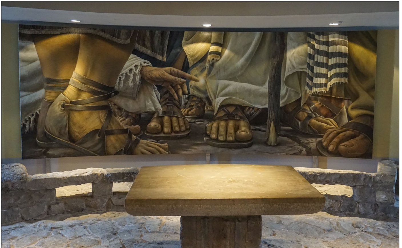
A view of the “Magdala Chapel of Encounter” in Israel, featuring a mural of Jesus’ encounter with the hemorrhaging woman.

Fourth Sunday of Epiphany – Birthday Sunday